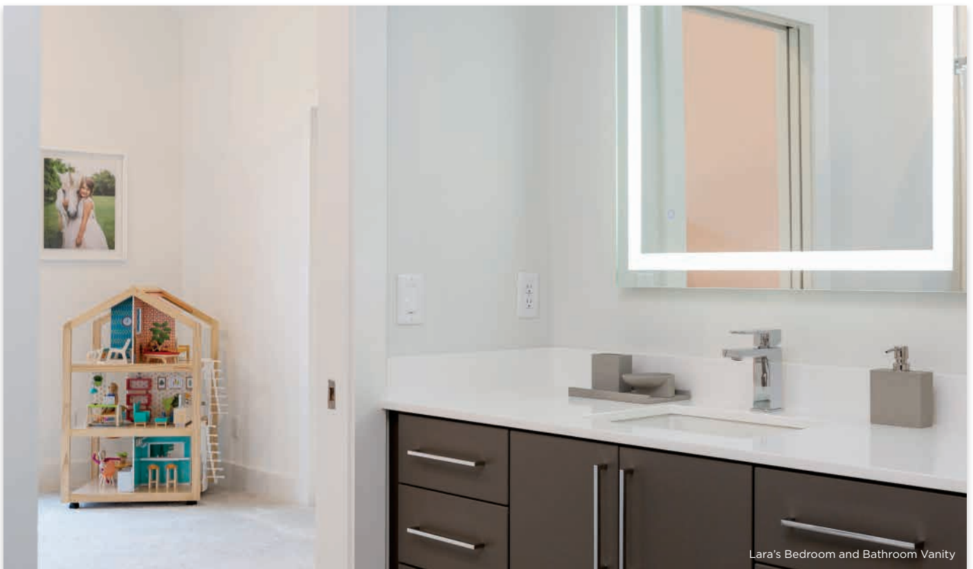
Lara's Bedroom and Bathroom Vanity